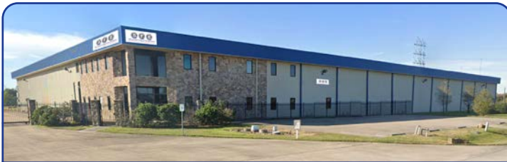
UNITED STATES HEAD OFFICE - HOUSTON

S.F.E. Group looks forward to welcoming you into its global network as a partner, distributor or end user customer and remains at your disposal at any time.