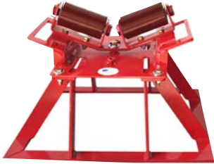
PN 2115 - 2" - 24" - 2,500 lbs.

Also, the roller mechanism can be attached to a stand better suited for pipeline work and/or directional drilling.