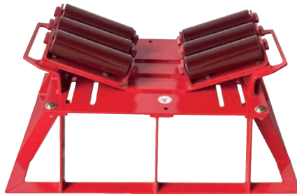
PN 2136 HD - 16" - 60" - 20,000 lbs.