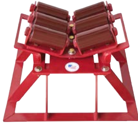
PN 2115 HD - 2" - 24" - 7,500 lbs.