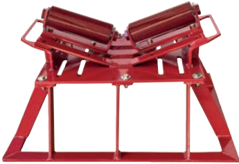
PN 2126 - 4" - 48" - 10,000 lbs.