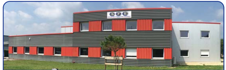
INTERNATIONAL HEAD OFFICE - FRANCE