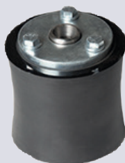
4" Roller PN 90024

Sealed bearing wheels with protective metal end flange. Great urethane replacement roller for most other brands. 4" x 6" with radius cutout for pipe shape and designed for 5/8" wire rope.