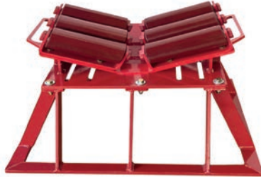
PN 2126 HD - 4" - 48" - 20,000 lbs.